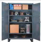
Durham Heavy Duty Storage Cabinet HDC-203678-4S95 - 12 Gauge 36"W x 20"D x 78"H