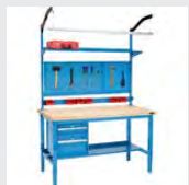
Global Industrial™ 60" W x 30" D Production Workbench - Maple Square Edge Complete Bench - Blue