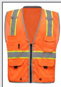
CLASS 2 HYPER-LITE SAFETY VEST W/BLACK SIDE