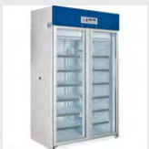
Global Industrial™ Upright Laboratory Refrigerator, 31.4 Cu.Ft., 2 Glass Doors MNF# 2453704