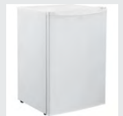
Nexel® Compact Upright Freezer, Solid Door, 3.1 Cu. Ft., White MNF# 243057