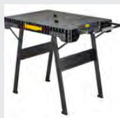
Dewalt Express Portable Folding Workbench, 1000 Lb. Capacity, Black - Pkg Qty 2