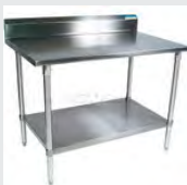
BK Resources 430 Stainless Steel Table, 48 x 24", Undershelf, 5" Backsplash, 18 Gauge