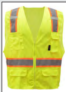
PREMIUM CLASS 2 MULTI-PURPOSE TWO TONE MESH ZIPPER 6 POCKETS