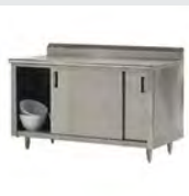
Advance Tabco 304 Stainless Steel Cabinet Table, 72 x 30", 5" Backsplash, Open Front, 14 Gauge