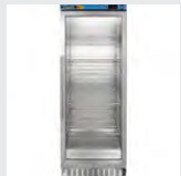
Accucold® Blanket Warmer, 10.57 Cu. Ft. Capacity, 23-5/8"W x 23-3/4"D x 60"H, Stainless Steel MNF# PTHC125G