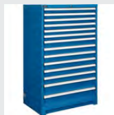
Global Industrial™ Modular Drawer Cabinet, 14 Drawers, w/ Lock, 36"W x 24"D x 57"H, Blue