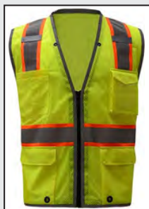
PREMIUM CLASS 2 HYPER-LITE VEST