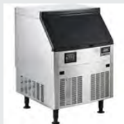
Nexel® Self Contained Under Counter Ice Machine, Air Cooled, 210 Lb. Production/24 Hrs. MNF# WB243029