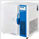
Global Industrial™ Ultra-Low Temperature Undercounter Lab Freezer, 3.5 Cu.Ft., Solid Door MNF# 2453707