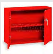
Equipto Handy Cabinet w/1 Shelf, 30"W x 13"D x 27"H, Textured Cherry Red