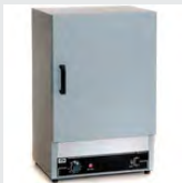
Quincy Lab 40GC Gravity Convection Lab Oven, 3.0 Cu.Ft., 115V 1500W MNF# 40GC