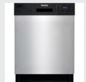
Danby® Built In Dishwasher, 12 Place Settings, Silver MNF# DDW2404EBSS