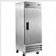
Nexel® Reach In Freezer, 1 Solid Door, 23 Cu. Ft., Stainless Steel MNF# 243009