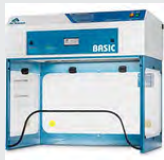
Air Science® P5-36XT Purair® Basic Ductless Fume Hood, 36"W x 27"D x 35"H MNF# P5-36-XT