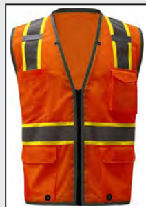
PREMIUM CLASS 2 HYPER-LITE VEST