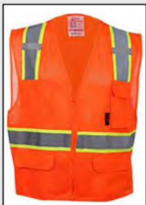
PREMIUM CLASS 2 MULTI-PURPOSE TWO TONE MESH ZIPPER 6 POCKETS