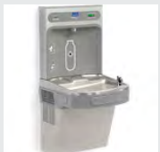
Elkay EZH2O LZS8WSVRLK Water Refilling Station, VR Bubbler W/Filter, Light Gray MNF# LZS8WSVRLK