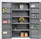
Global Industrial™ Storage Cabinet With Interior Shelving, Gray, 38"W x 24"D x 72"H