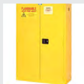
Global Industrial™ Flammable Cabinet, Self Close Double Door, 30 Gallon, 43"Wx18"Dx44"H