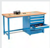
Global Industrial™ 72Wx30D Modular Workbench, 5 Drawers, Maple Butcher Block Square Edge, Blue