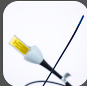
Diagnostic Ultrasound Catheters