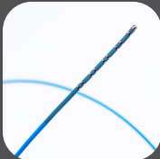
Diagnostic EP Catheters

Innovative Health can reprocess all major brands within the following device categories: