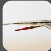
Intravascular Ultrasound Catheters