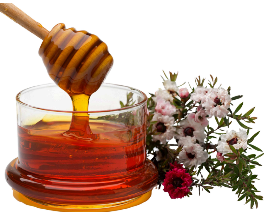
Leptospermum scoparium (Manuka flower)

Trusted by professionals worldwide, these products are backed by Gentell's industry-leading service, support and manufacturing capabilities, ensuring consistent quality and availability for your wound care needs.