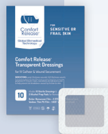
2.375" x 2.75" GB 110 // HCPCS: A6257