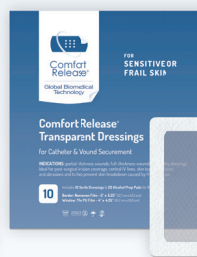
5" x 5.25" GB112-W // HCPCS: A6258