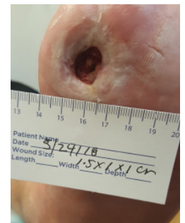
41 days post-Interfyl #1 flowable below and around flexor tendon space. Prior to Interfyl #2