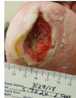
Prior to Interfyl implant

Type 2 diabetes mellitus (DM) with polyneuropathy